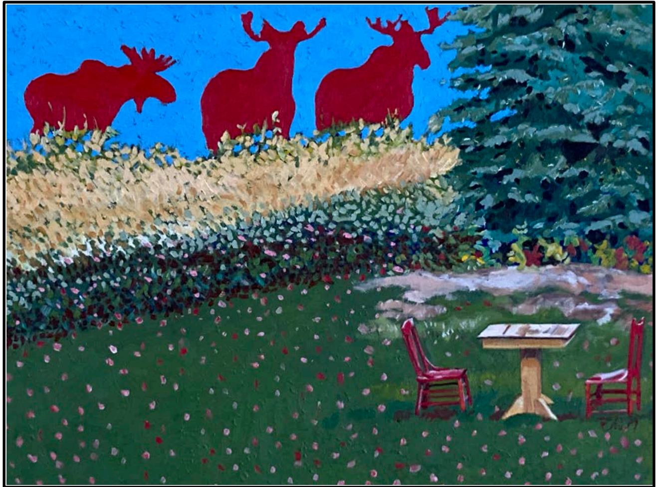
#410 ghosts in the field oil on canvas 18"x24" 2022