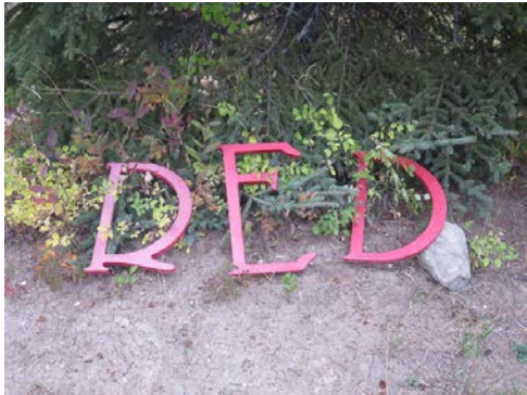
#411 RED 1 oil on canvas 14"x14" 2022