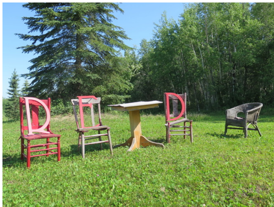
#407 my aging tables and chairs oil on canvas 14"x14" 2022