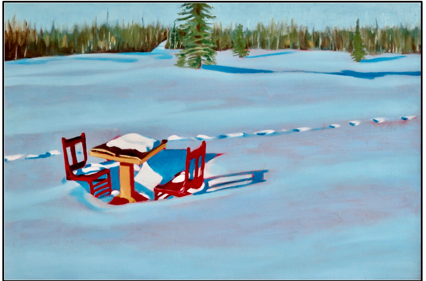
#408 where the moose roam 16"x24" oil on canvas 2022